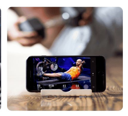
Use our equipment